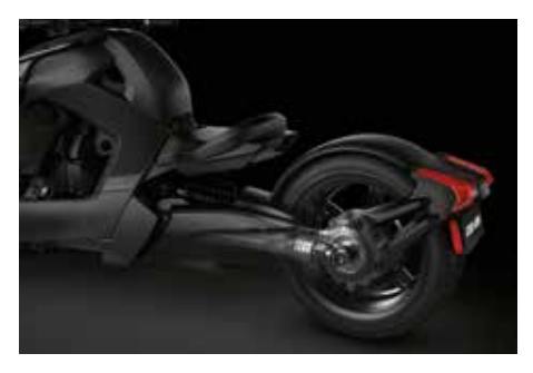
DRIVESHAFT: Highly durable and robust driveshaft technology will help you enjoy a smooth ride all along the way. No need for further adjustment, alignment or maintenance.