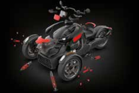
CUSTOMIZATION: Can-Am Ryker was engineered to be almostinfinitely customizable with 1 or 2-up options! Moments are all it takes to give it a transformation.