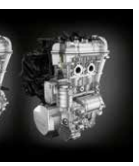
ENGINE OPTIONS: The 2-cylinder Rotax 600 ACE is the ultimate in accessible performance, while the 3-cylinder Rotax 900 ACE is the power & excitement standard of choice!