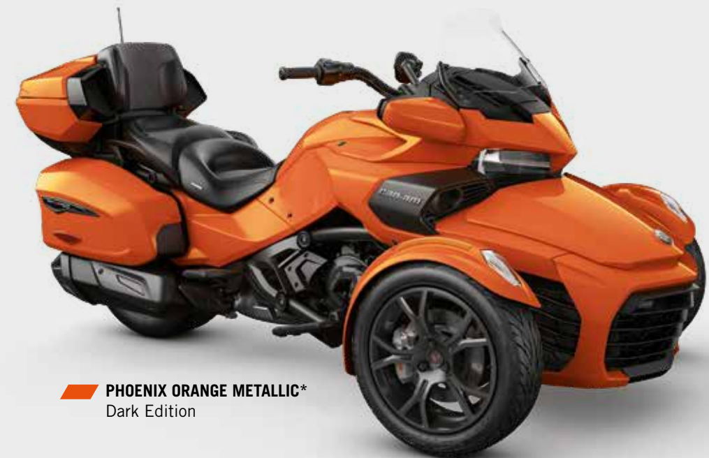
PHOENIX ORANGE METALLIC* Dark Edition

*Parts and trims available in Chrome or Dark Editions