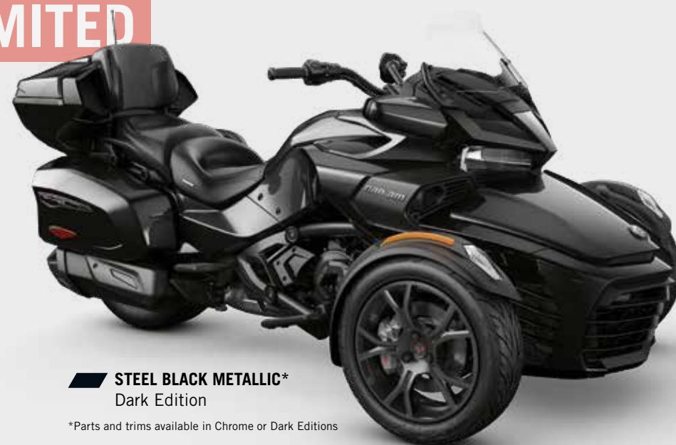
STEEL BLACK METALLIC* Dark Edition

*Parts and trims available in Chrome or Dark Editions