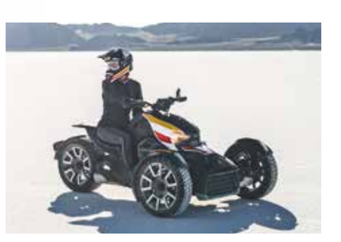
RALLY TIRES: All-Road adapted tires with higher durability and more precise response for improved handling.