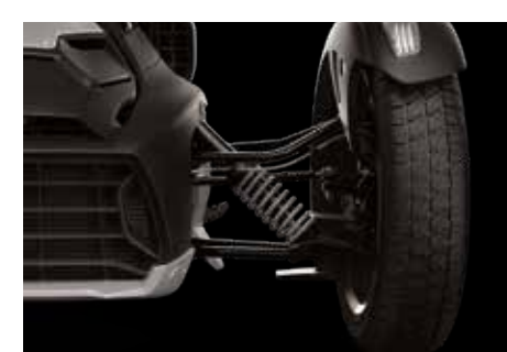
KYB SUSPENSION: Allows 1 inch extra suspension travel and adjustability on the rear which provides four different compression settings to optimize your ride.