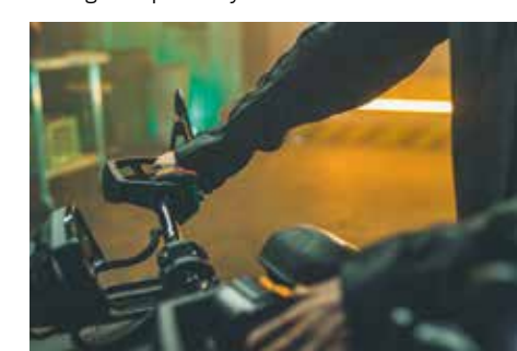
HANDGUARDS: Provides protection for hands against rocks and other debris.