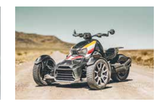
RALLY MODE: Allows you to have more flexibility and fun off-pavement by optimizing VSS input and enabling you to perform controlled drifts.