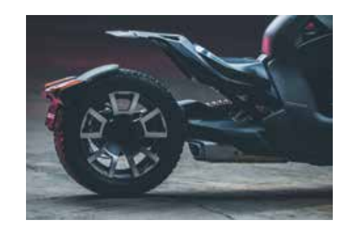
MAX MOUNT STRUCTURE: Makes the unit 1+1 ready. It also increases the carrying capacity for different storage options.