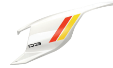
Heritage White II